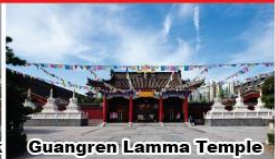
Guangren Lamma Temple