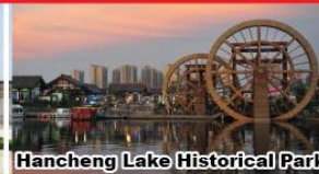
Hancheng Lake Historical Park